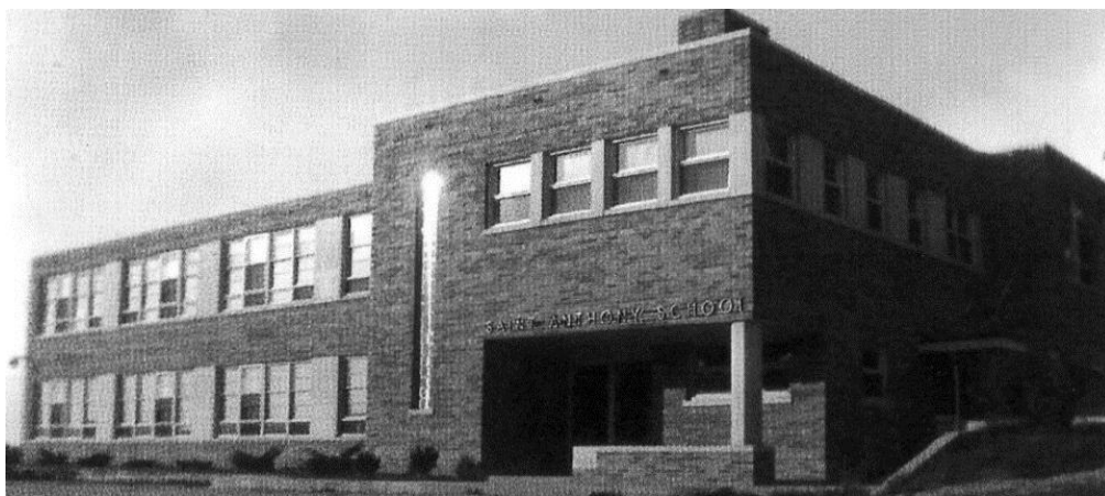
New St. Anthony Parish School, 1953

And then the war ended, and the Town of Fussville was energized. Not only were thanks given for the end of rationing and blackouts, but at last, young men of the community were returning home. They came home to Fussville, as did others, and married and settled down. It was the baby boom era and Fussville grew and prospered.