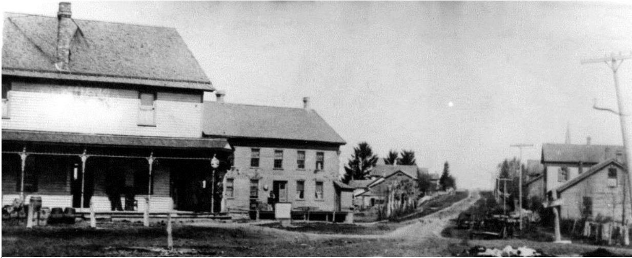
Intersection of Hwy 41 and Hwy W (Appleton and Good Hope Rd)

longer needed to stop in Fussville for rest and refreshment but found Menomonee Falls suited their needs. St. Mary Catholic Church was built in 1905 and enrollment at St. Anthony went from 250 families to less than 100. xvi Yet, Fussville was still a place of faith and community. Kermis, the town's celebration of St. Anthony Church's founding, was held every year, along with May Crownings and special blessings for spring planting and fall harvests. A close knit community, the intermarriage within the large families meant everyone knew and was related to most everyone else, in one way or another.