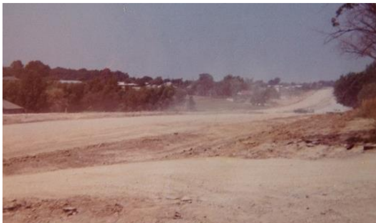
Hwy 41/175 after Demolition (looking north)

In the mid 1950s, due to increasing traffic volumes, US Hwy 41 was relocated to a new corridor approximately one mile north of, and parallel to, the old right of way through Fussville. The old right of way was given a new designation - State Trunk Hwy 175. xxiii