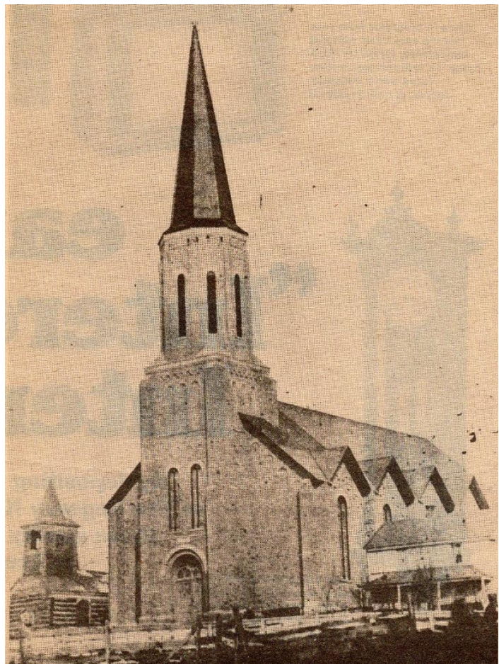
Second and Third Churches of St. Anthony the Hermit